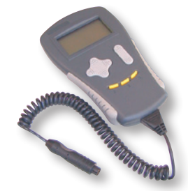
The Curtis Model 1311 Handheld Programmer is ideal for setting parameters and performing diagnostic functions.